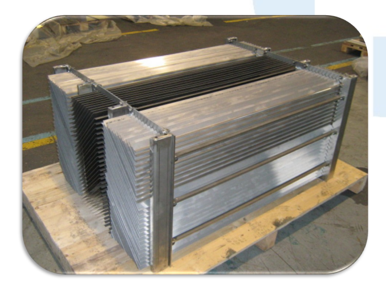
A fully removable plate pack for MFX Unit

Depending upon the concentration of suspended solids and waxes, the plate spacing and plate inclination can be varied to suit the particular process conditions. This design flexibility enables us to offer our clients a technically optimised solution for each individual application.