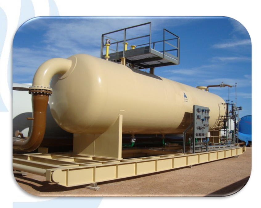
A Degasser Unit complete with Instrumentation.

The oily water flows into the pack of inclined plates from the top and passes down through the plate pack. The plate pack is hydraulically designed in such a way that laminar flow conditions exist in each 'channel' (i.e. the distance between the subsequent plates). In this laminar flow the minute oil droplets rise by virtue of the fact that their density is less than that of the water and attach themselves to the underside of the upper plate of the channel. The oil film that is constantly being formed at the underside of each plate creeps slowly upwards along the plates. At the top of each plate the oil film is concentrated (coalesced) by the special fingers and leaves the plate at the fingertips as a thick stream or a rising chain of large bubbles. Also any micron size gas bubbles, still contained in the water after initial gas release in the primary chamber, will rise. These gas bubbles in general are oleophylic so that they will easily adhere to the minute oil droplets. This 'natural flotation' effect gives the oil droplets an increased rising velocity and thus accelerates the separation process.