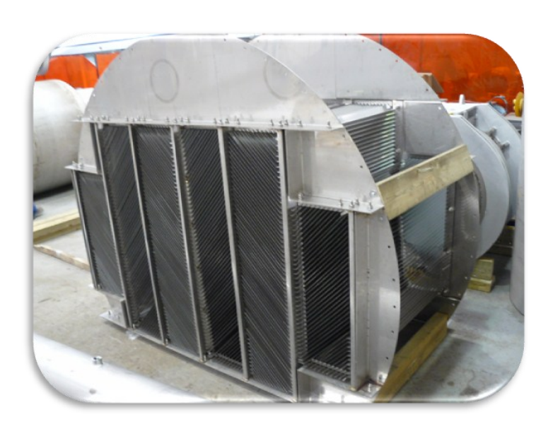
A larger plate pack for use in MFX separator

It can be seen that the multiphase separator offers considerable savings in weight, space and cost. In addition, the process requires less controls so that operator attendance and maintenance is kept to a minimum.