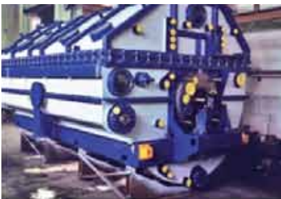
(Top Right) Horizontal Rubber Belt Filter

Horizontal rotating table for suspensions with fast settling solids without cloth blinding properties. Continuous filtration and cake washing. Cake discharge by scroll, moving the cake over the edge of the table into the discharge chute. Applications in mining and metallurgical beneficiation, and in the chemical industry. Filter sizes up to 80m 2 .